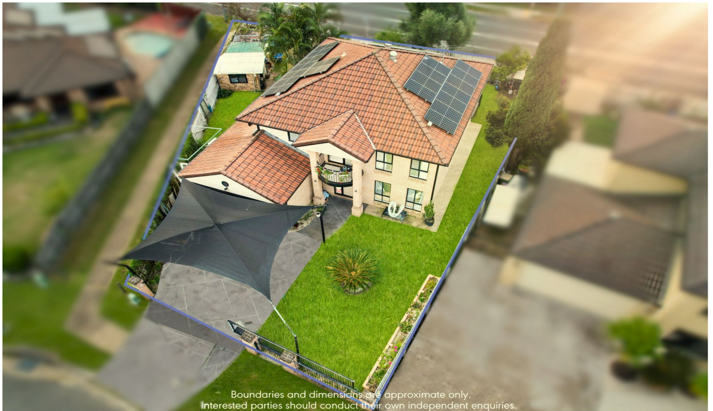
Boundaries and dimensions are approximate only. Interested parties should conduct their own independent enquiries.